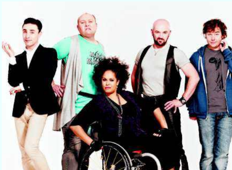
NO GO: Outland characters just sit around and have no endearing qualities

But the real focus of the episode is the hunt for a vocalist for their new single.