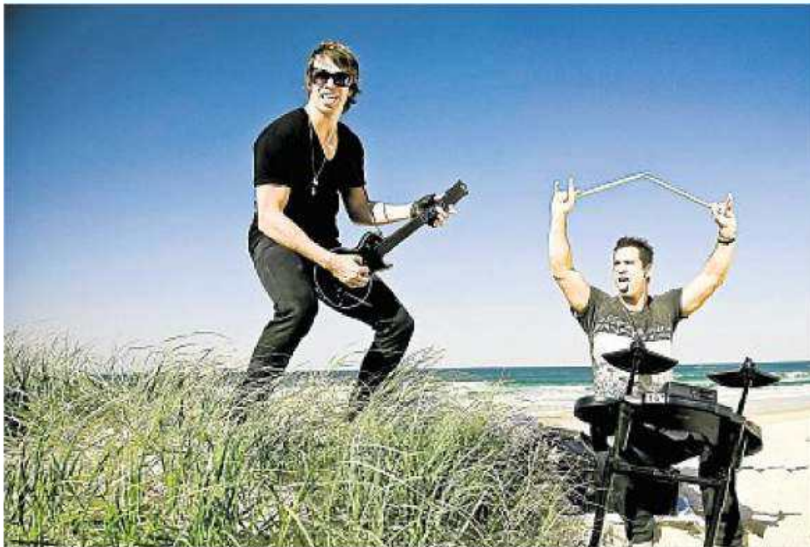
HEADING NORTH: Check out the Stafford Brothers on February 18.

Daily Examiner office in Grafton or Yamba. Each ticket gives the winner and a friend the opportunity to chat to the Stafford Brothers for half an hour before the show.